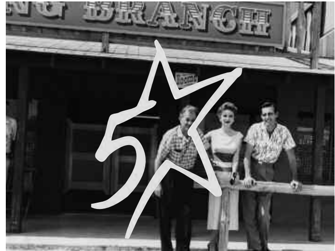
SEPTEMBER 1959 Milburn Stone, Amanda Blake and Dennis Weaver pose in front of the real Long Branch Saloon in Dodge City, Kansas.