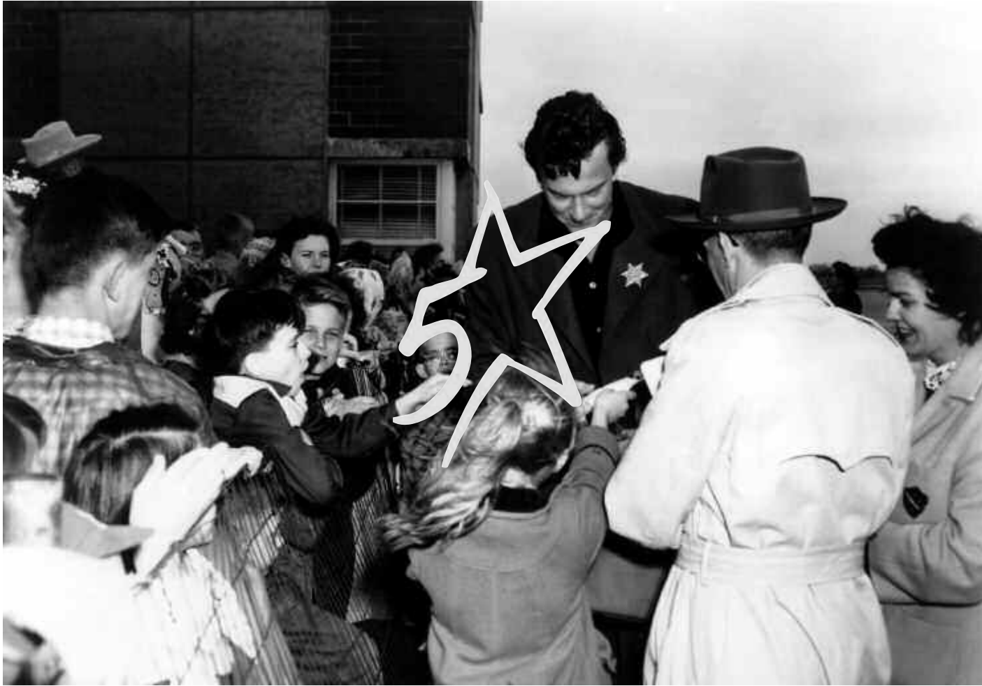
MR. DILLON, MR. DILLON! James Arness is mobbed by fans after a personal appearance in 1958. The stars of GUNSMOKE always accommodated those who wanted autographs and pictures.