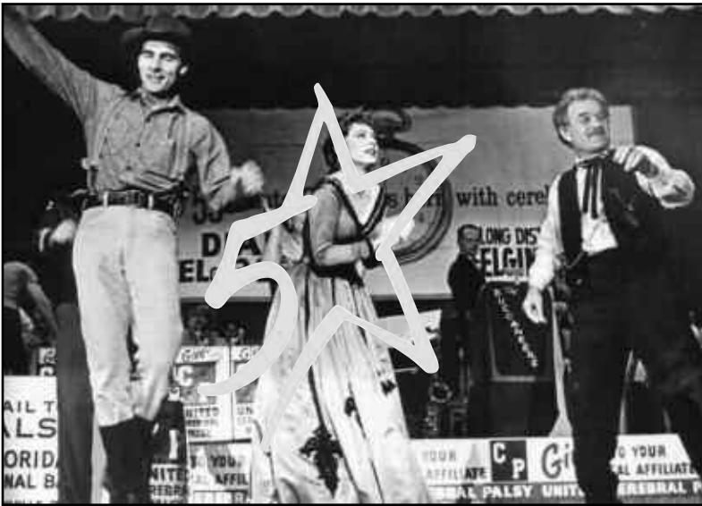
UNITED CEREBRAL PALSY TELETHON Dennis Weaver, Amanda Blake and Milburn Stone lead the crowd in a rousing rendition of the song, “He’s Got the Whole World In His Hands,” the finale used in most of their live shows.