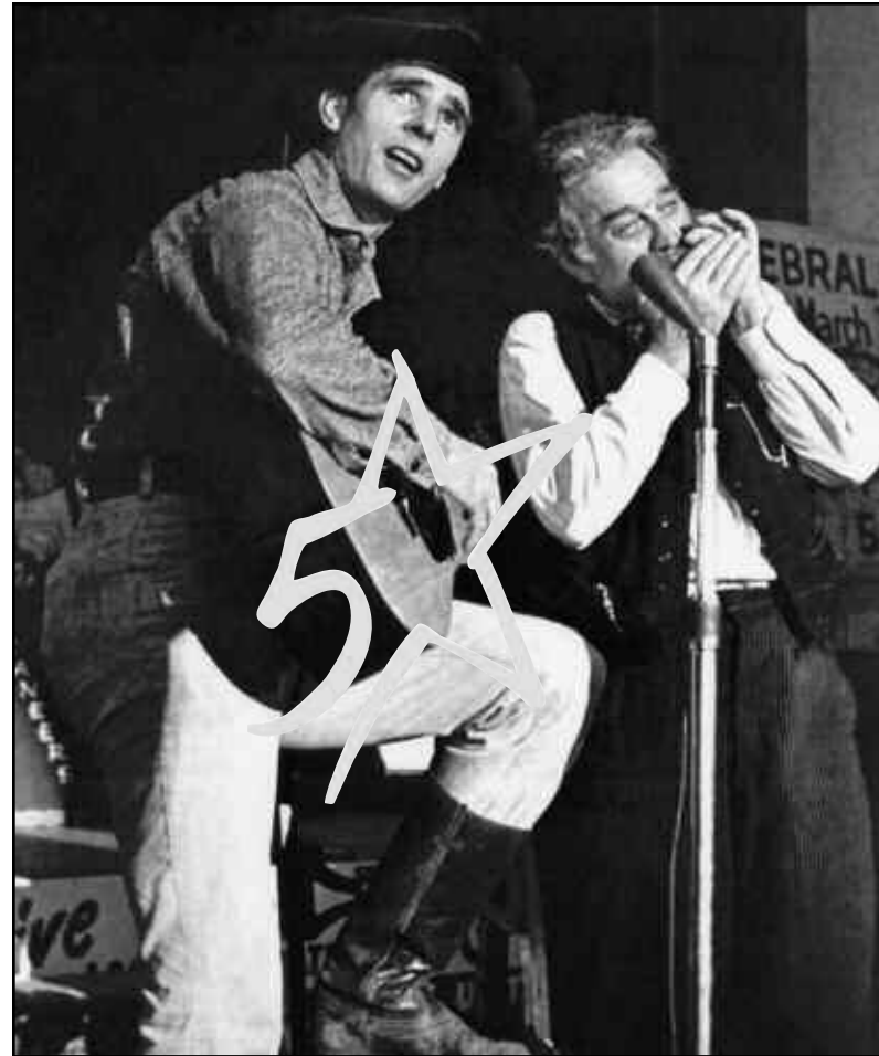
RUN RABBIT, RUN Chester and Doc stop bickering long enough to make music during a performance in Jacksonville, Florida.

of episodes. You know, I’ve worked with him and he might be good,” recalled McLaglen. “They signed me up for two, and ninety-five Gunsmoke ’s later...”