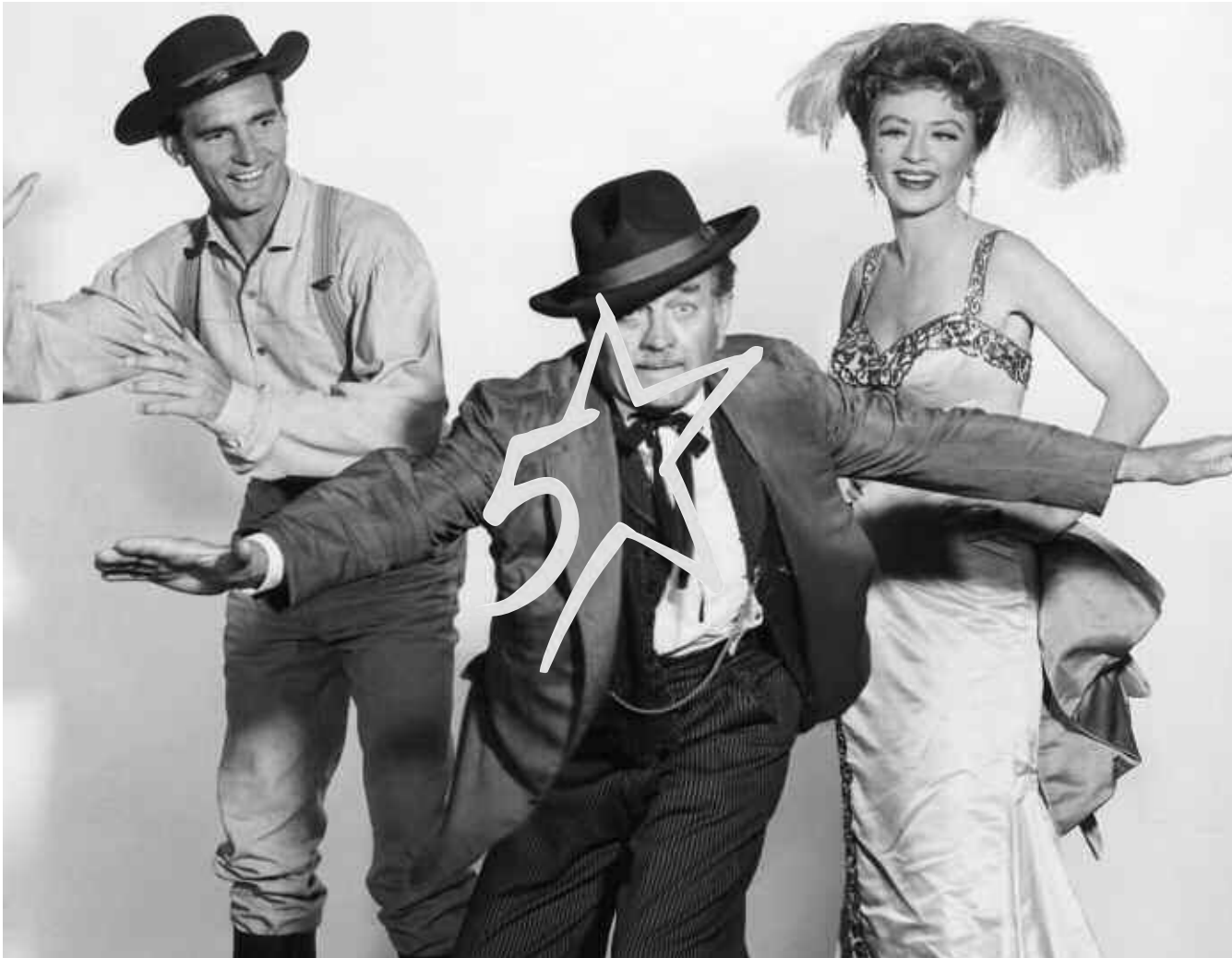
A TALENTED TRIO Dennis Weaver, Milburn Stone and Amanda Blake, better known as Chester, Doc and Miss Kitty, coming soon to a venue near you! This photo was used to announce dates for the 1960 Rodeo Circuit Tour.