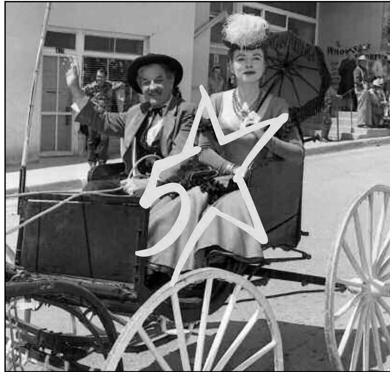
SHERIFF PAT GARRETT'S BUGGY Milburn Stone and Amanda Blake ride the real deal in the Truth Or Consequences Fiesta Parade in New Mexico, 1958.