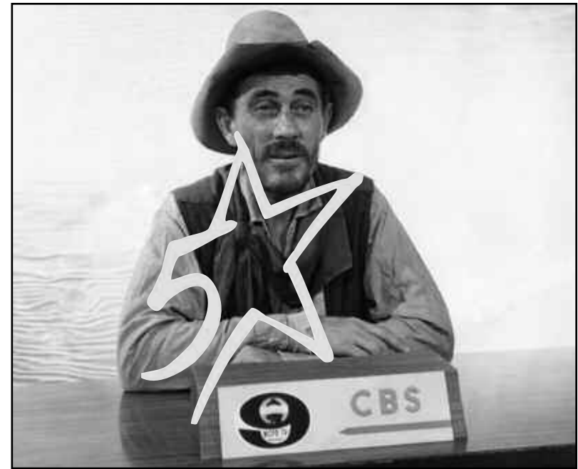
FESTUS MEETS THE PRESS Ken Curtis talks shop with the media in Cincinnati, Ohio before an appearance in the sixties.