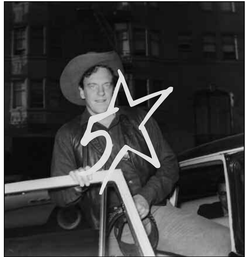
GRAND MARSHAL DILLON James Arness led the parade for the 15th Annual Sheriff’s Rodeo at the Los Angeles Memorial Coliseum, August 23, 1959.