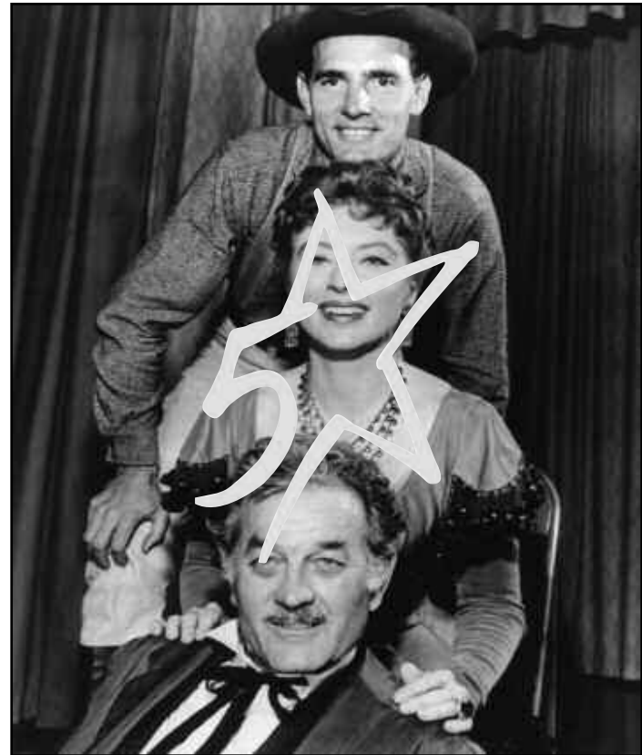
ANOTHER OPENIN', ANOTHER SHOW The three popular GUNSMOKE stars pose in the auditorium of their latest live appearance, circa 1958.

Born in London, England in 1920, the son of Academy Award winning actor Victor McLaglen, he began his career in 1944, playing an uncredited role in the film Since You Went Away . Preferring work behind the camera, which he began in 1948, McLaglen worked on a multitude of projects, including assistant director on The Quiet Man for John Ford, and two projects that featured a young James Arness, Big Jim McClain and Hondo , where he functioned as assistant director and unit production manager, respectively.