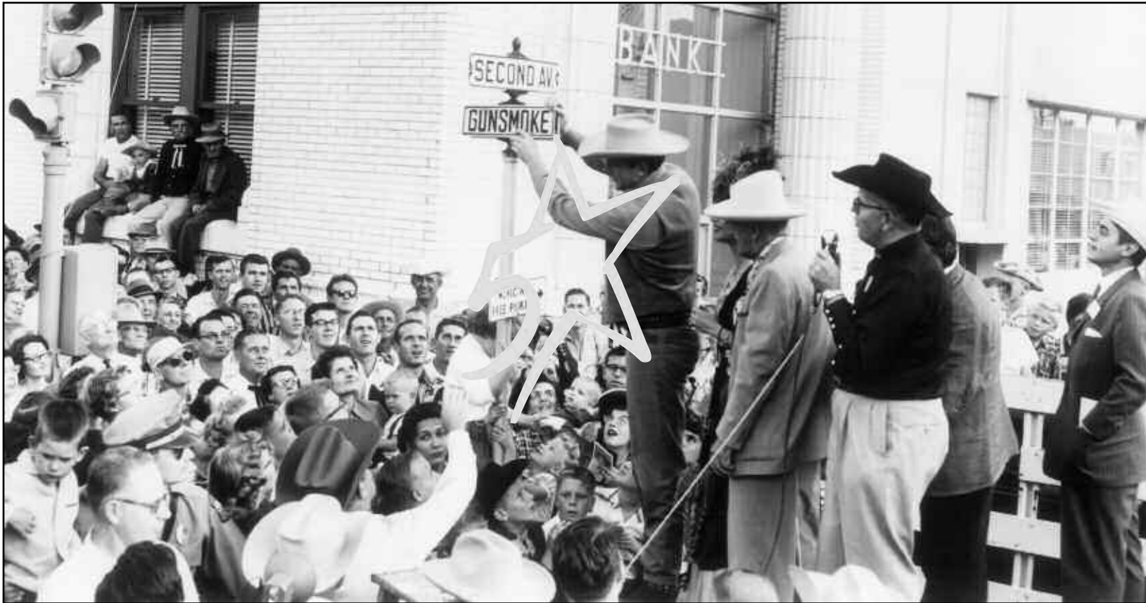
WALNUT STREET TO GUNSMOKE STREET Series star James Arness officially changes the street signs, downtown Dodge City, Kansas, in 1958. Amanda Blake and Milburn Stone, partially hidden, proudly look on.

A LIVE APPEARANCE BY ANY OF THE GUNSMOKE STARS WAS ALWAYS SO MUCH MORE THAN JUST PERFORMING.